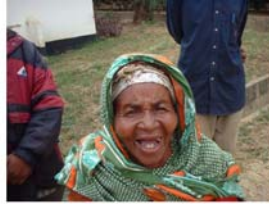
A patient who could not control her joy of seeing after a long time

Tel +44 (0) 1494 762 063, Email info@ladyfatemahtrust.org , Fax +44 (0) 1494 762 286, Mobile +44 (0) 7798 76 10 20, Fax +44 (0) 7798 76 90 30 Website: http://www.ladyfatemahtrust.org