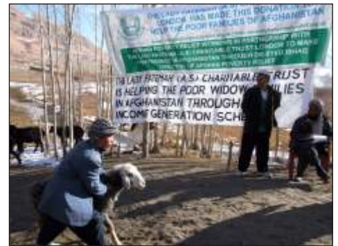
Income Generation Project. Afghanistan.