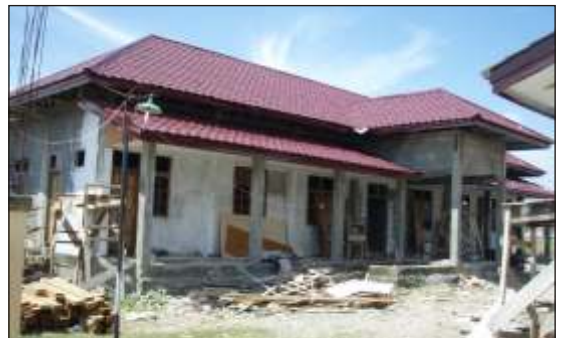
Orphanage in Aceh