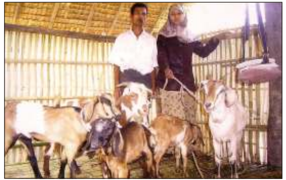
Income Generation Project following Cyclone Nargis, Burma

Thanks to your support, The Lady Fatemah Trust has helped save and improve the lives of thousands of people in many of the poorest countries, worldwide. Although the amount of relief work required is colossal, collectively we can make a difference. Together we can change the world, one life at a time.