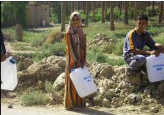
Cholera Disinfection Project, Iraq