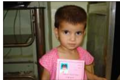
An Iraqi orphan receiving monthly assistance