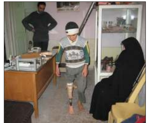
This 12 year old Afghani boy lost his leg in rocket fire, and was fitted with a prosthetic limb on the MRP.

3. Eye Camps; Tanzania, Pakistan and Kashmir: The Trust regularly funds eye camps in remote Tanzanian villages where cataract removal and other ophthalmic procedures are undertaken. Due to the lack of facilities and extreme poverty, these patients would almost certainly go blind without these camps. In association with our partners in Pakistan and Kashmir, cataract surgeries are undertaken every month, either free of charge or at a nominal cost, at the Munnawar Memorial Hospital.