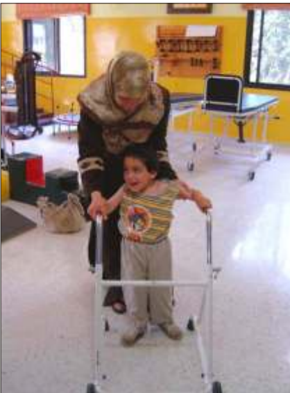
Special Needs Child, Lebanon