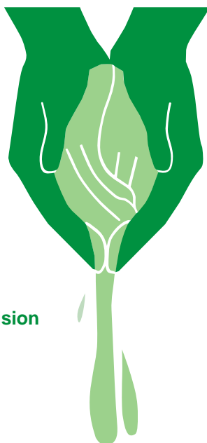
Clean Water Provision