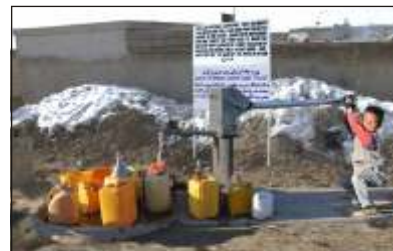
Hand water pump, Afghanistan