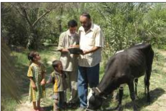
Milking Buffalo Project, Iraq