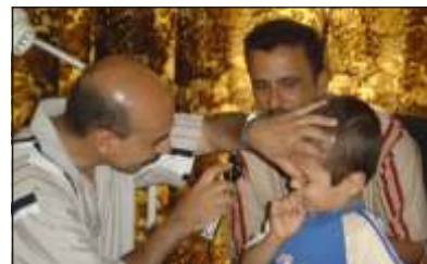
Eye clinic, Karbala, Basra