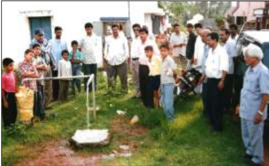
Water Well, Priyapatna village, India

We assist people in need to reduce their dependence on humanitarian aid and facilitate their transition to self-reliant, long-term development. Only when individuals are given the means and skills to help themselves can poverty be eradicated