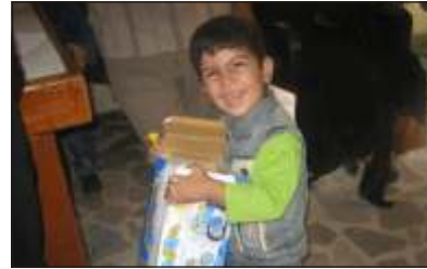
An Iraqi orphan delighted with his Eid gift

The Trust combines a global perspective with local insight. As such, our partner organizations on the ground closely scrutinize each of the appeals that arise and are available to provide on-going support and guidance. They are directly in touch with the communities where the need is most, thus ensuring the assistance reaches there. Wherever possible, the Trust endeavours to work closely with other international charities, so as to leverage the full benefit of the collective goodwill of donors and local expertise. We have found that joining hands with other organisations, often results in achievements beyond the scope of any one charitable institution.