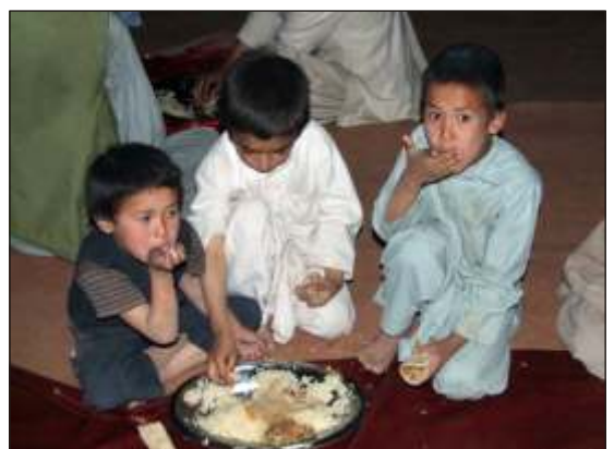
Iftaar Relief, Afghanistan

Thank you for taking the time to read our brochure, and for your support. For a detailed account of all our work, please visit our website: www.ladyfatemahtrust.org